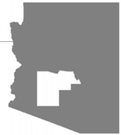
Phoenix MSA: Supply & Demand